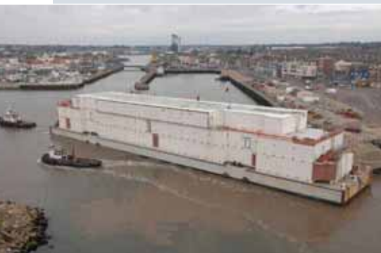
One of the Two AGIP Barges Leaving Lowestoft

Document packages have been completed and final as-built drawings are now progressing to conclude the contracted work scope. The sail out from Lowestoft marked the start of a long sea and river journey to the Caspian Sea. ■