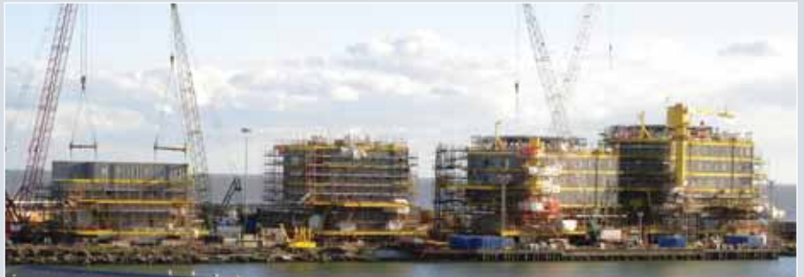
The Four Maersk Modules on the Lowestoft Yard