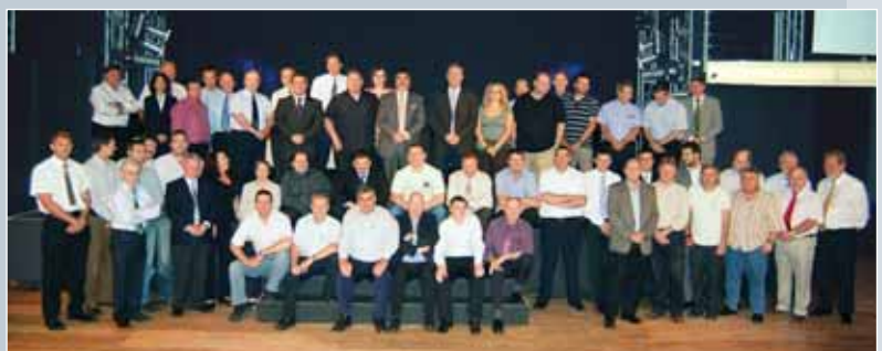
The BP Project Team

The project was rolled out at the first 'all hands' meeting held on the 27th September at the Marina Theatre in Lowestoft. ■