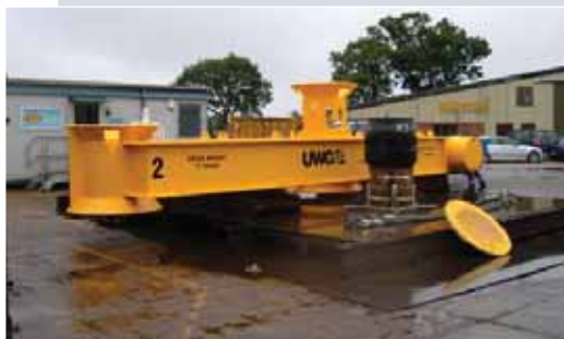
2-slot Drilling Template Ready for Transportation

As part of the "Project Development" support provided by SLP to Venture Production PLC, SLP were requested to supply a drilling template to assist with the development of the Ensign Field.