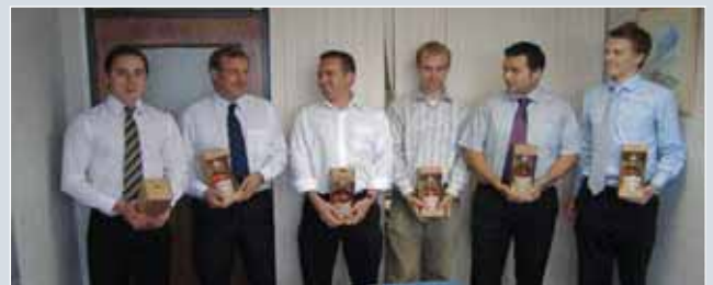
Team Members Celebrate Their Success