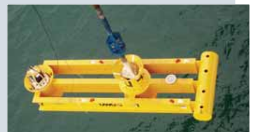
2-slot Drilling Template Being Installed by the Drilling Rig. The template has a video camera so the position can be confirmed.

December 2007 when the development options for Ensign will be evaluated. ■