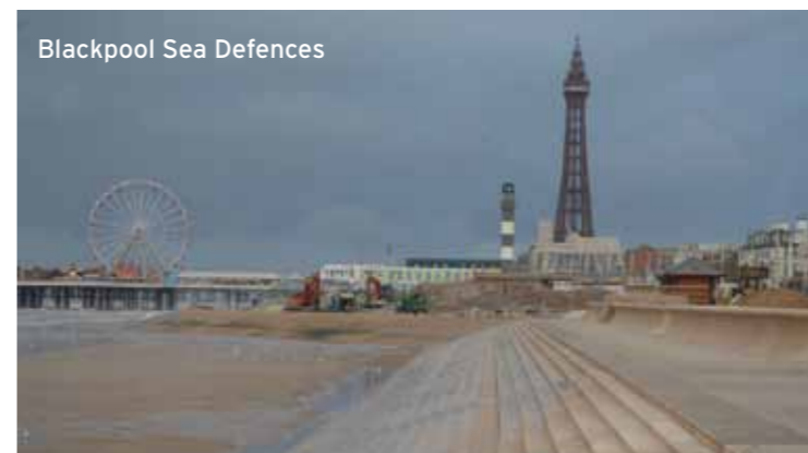
Blackpool Sea Defences

Finally, having been nominated the preferred 'precaster' for a new detention facility being built in the Midlands, it goes without saying that SLP is going from strength to strength. The contract is set to be awarded in September 2009 with the project running through to 2011.