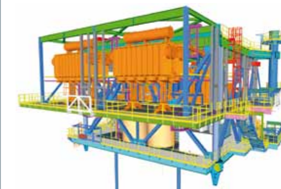
Thanet substation structure

The 1250 tonne substation structure is expected to be loaded out from SLP's Lowestoft facility in early 2010.